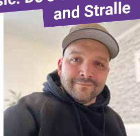
Music: DJ's Tetrastyle and Stralle